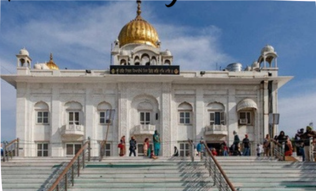
Gurdwara Bangla Sahib